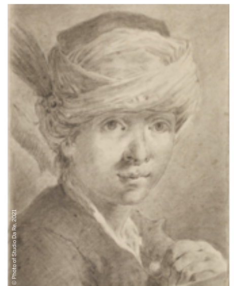
Giovanni Battista Piazzetta (attributed to), Boy's Head , 18 th century, drawing