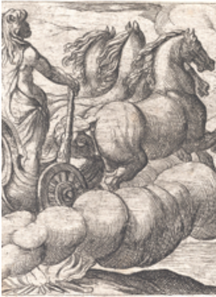
Antonio Tempesta, Apotheosis of Hercules (detail), 1606, etching