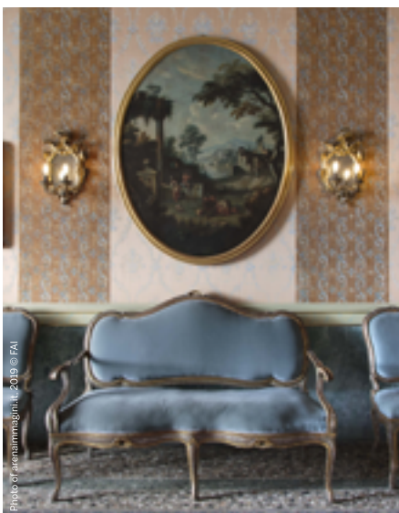
Room of the Apotheosis of Hercules, close-up of the wall