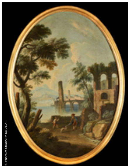
Vittorio Amedeo Cignaroli, Landscape , 18 th century, Room of the Apotheosis of Hercules