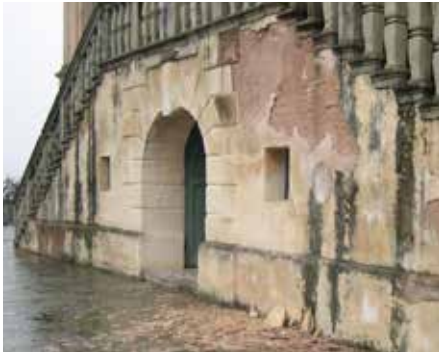
2006, the Villa dei Vescovi, western facade