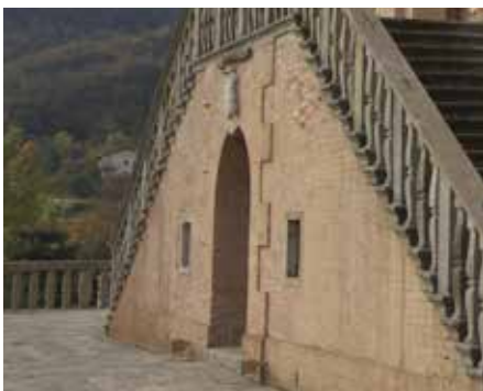
2013, the Villa dei Vescovi, western facade

The architectural restoration (c. 2008-2011) was targeted at respecting not only the physical and material substance of the villa, but also its architectural and environmental harmony. The works encompassed cleaning, consolidation and protection, all of which were essential to preserve the physical nature of the building, with a particular focus on the surfaces, flooring and decorations. The restoration did not alter the distribution of the spaces, with the works and the new services designed in such a way as to be non-invasive.