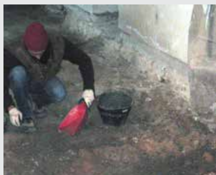
2007, the Villa dei Vescovi, ground floor