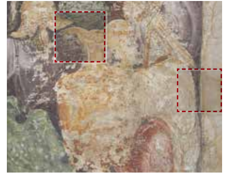
Ancients Figures Room, frieze, during restoration