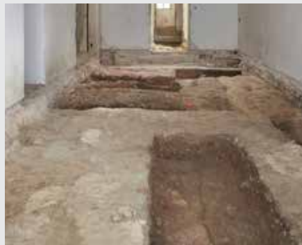
The Villa dei Vescovi, ground floor during the excavations

Carried out under the supervision of the Veneto Region's Archaeology Office, the excavation works have brought to light ceramics and glass dating from the 6 th and 7 th centuries - far earlier than the oldest known documents concerning the Luvigliano area (12 th century). These pieces form part of a series of tombs (a full 35 have been analysed) that are indicative of the presence of a cemetery adjacent to the church of San Martino. Also of interest is the discovery of a considerable section of mediaeval wall, built to protect not just the church, the baptistery and the burial ground, but also some nearby storehouses.