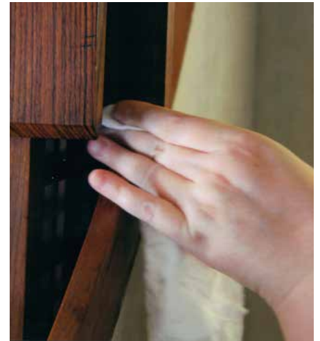
Dusting the wood elements

Tarnished after years of abandonment and inappropriate use, the wood surfaces were damaged and then were brought back to the original state according to each element of Carlo Scarpa's design. For its fragility, the Negoziò needs constant reliable care: FAI looks after it every day to preserve for the next generations this monument of great historical, artistic, social, and cultural value.