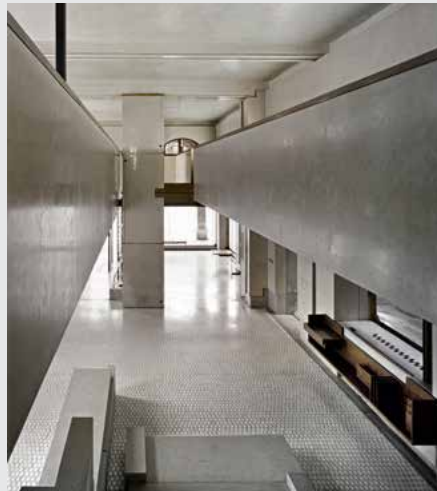
The surfaces after the restoration

During some works in 1984, all the surfaces in Venetian stucco had been covered with a yellow-ochre coloring that in some spots was shiny and reflective, contrasting with the grey hues of the Aurisina marble and the original color of the stucco. The more recent layer was removed to reveal the perfectly preserved original color. The initial material was unveiled to be still intact.