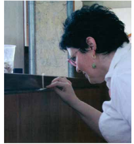
Conservative restoration of the wood elements