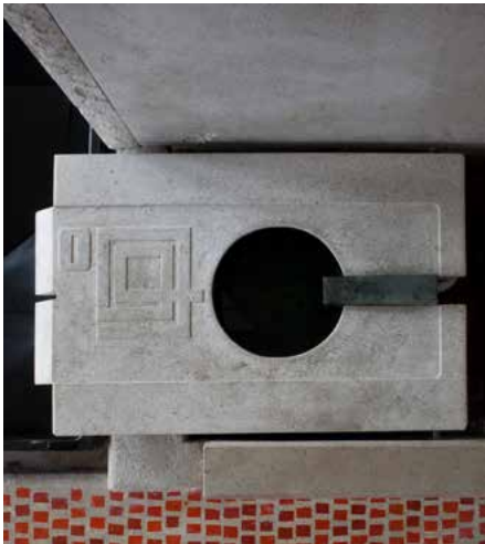
A detail of the sculpture by Viani after the restoration

The preliminary examinations of the restoration work shed light on the intended modifications, in the course of time, as compared to the degradation of the materials. A fire, for example, had blackened the walls and ceiling of a room on the upper floor while some original hues had been changed on purpose. The basin in black Belgian marble and the sculpture had a coat of dirt then removed.