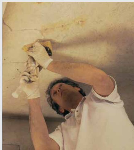
Cleaning the ceiling