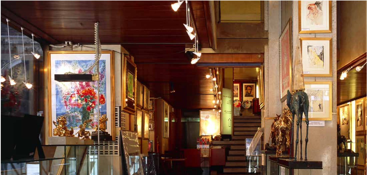
Negozio Olivetti before the restoration and consequent management of FAI

After Olivetti closed the Negozio in 1997, the premises were inadequately used for a touristy shop, inconsistent with the architectural quality of the place. Assicurazioni Generali, the owner, undertakes the restoration and entrusts the management of the Venetian showroom.